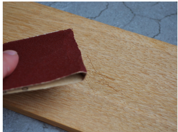
Sand of the worst part of the scratch