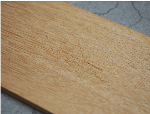
Scratched wooden part

Scratches can be touched up by local treatment with Rubio Monocoat Oil Plus 2C. Use the natural or pigmented oil depending on the ribs original treatment. Small damages will be less visible and the oil gives the injured surface back it's surface protection. Maintenance cycle depends on rate of use/wear. Use the Rubio Monocoat Plus 2C oil to touch up the top layer of the wooden parts of the bench. This is a two component mixture. One can is the natural or pigmented oil and one can is the hardner. Mixture ratio is 3-1. Continius surface care minimizes visable scratches and marks. This treatment will help protect the bench.