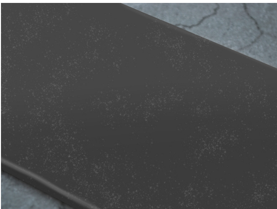
Metal parts will collect dust

All metal parts are powder coated which is a very durable surface treatment. The maintenance for metal parts only consists of cleaning. The cleaning can easily be done by wiping surfaces of with water and a cloth.