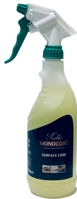
Rubio Monocoat Surface Care

It is also possible to remove graffiti and other difficult stains. Use the white cleaning sponge ('magic sponge') for removing marker pen, crayon stains, shoe scuffs, etc. Use with only water and afterwards clean with the cleaning soap or Surface Care from Rubio Monocoat. If the stain goes away when rubbing gently, no need for re waxing. You may need to rub harder and for long time - if you see a colour difference where you have rubbed, then treat afterwards with the wax oil (Oil Plus 2C of your colour(s)).