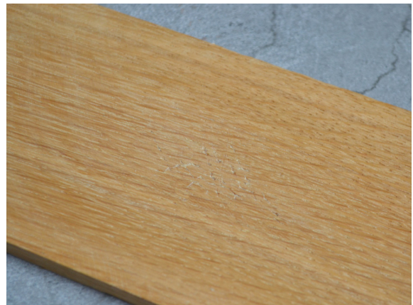
Let the oil dry. Drying time is 12 hours until completely dry.