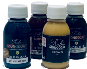
Rubio Monocoat Oil Plus 2C

- Put in a container that is flameproof.