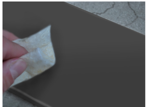
Wipe of with a wet cloth