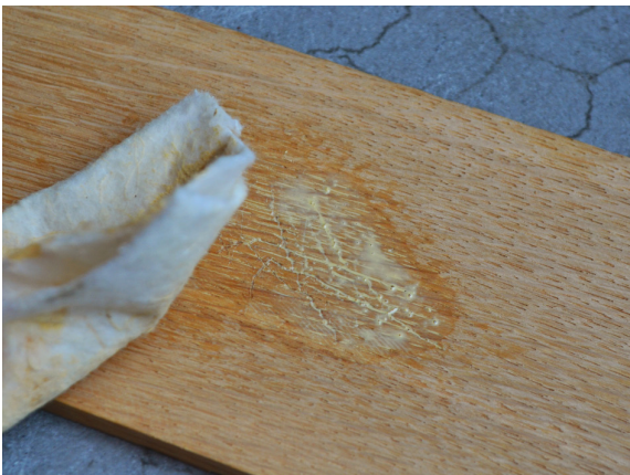
Re-oil with Rubio Monocoat hard wax oil